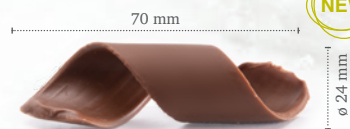
Curl XL 41187 (±180 pcs)