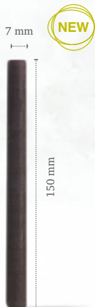
Straw dark 7 mm 71188 (97 pcs)