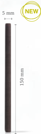
Straw dark 5 mm 71811 (135 pcs)