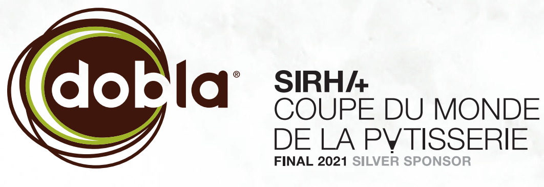
FINAL 2021 SILVER SPONSOR