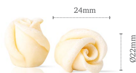
Chocolate rose mini white 77495 (45 pcs)