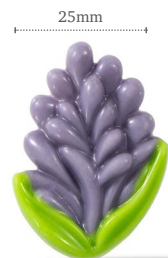
Lavender 78344 (160 pcs)