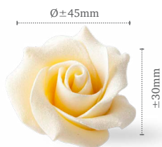
Chocolate rose 77490 (15 pcs)