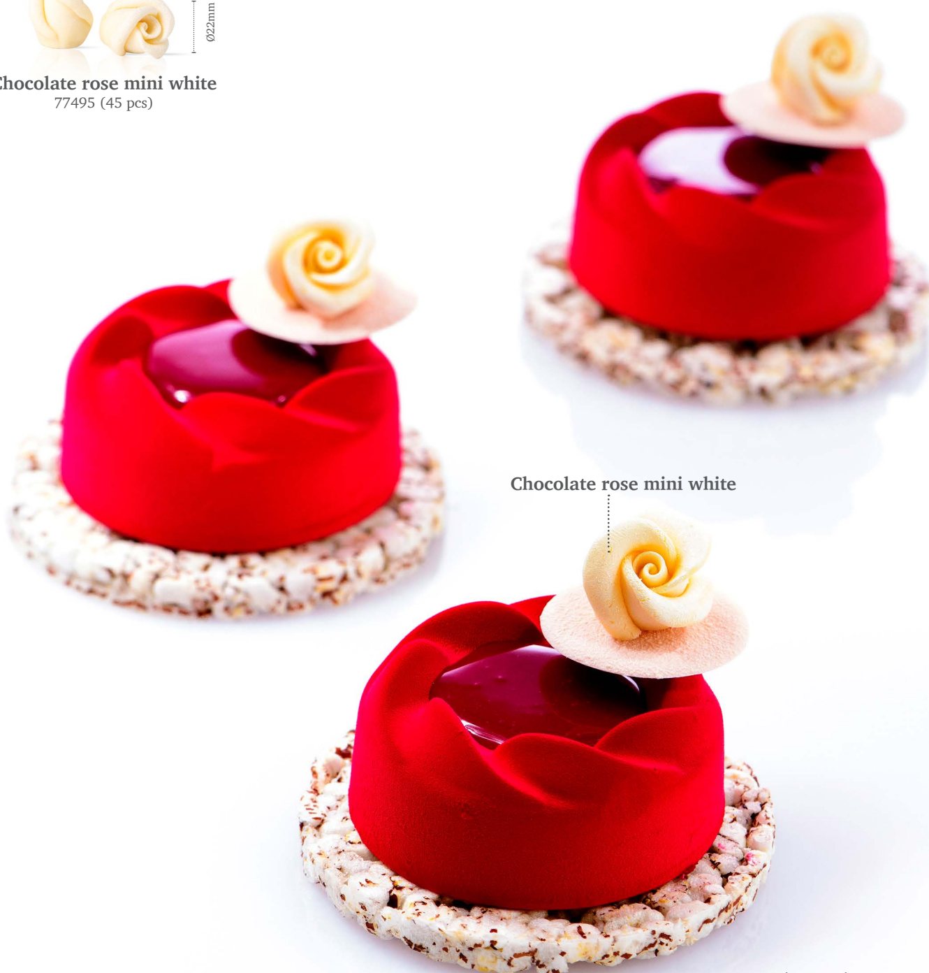
Chocolate rose mini white