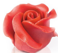
Chocolate rose red 77561 (15 pcs)