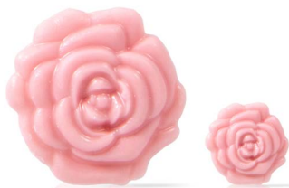
Rose 2D pink