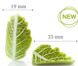
Curvy leaf green 77679 (144 pcs)