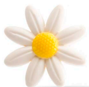
Daisy XL 78324 (108 pcs)