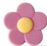
Pink flower 78222 ( \pm 302 pcs)