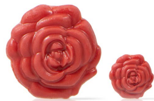
Rose 2D red