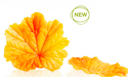
Fall leaf yellow 77688 (24 pcs)