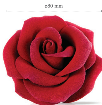
Chocolate signature rose 77397 (11 pcs)