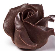
Chocolate rose dark 77491 (15 pcs)