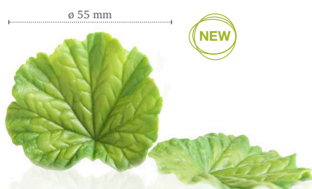
Spring leaf green 77687 (24 pcs)