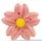
Sakura 78326 (120 pcs)