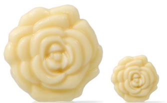
Rose 2D white