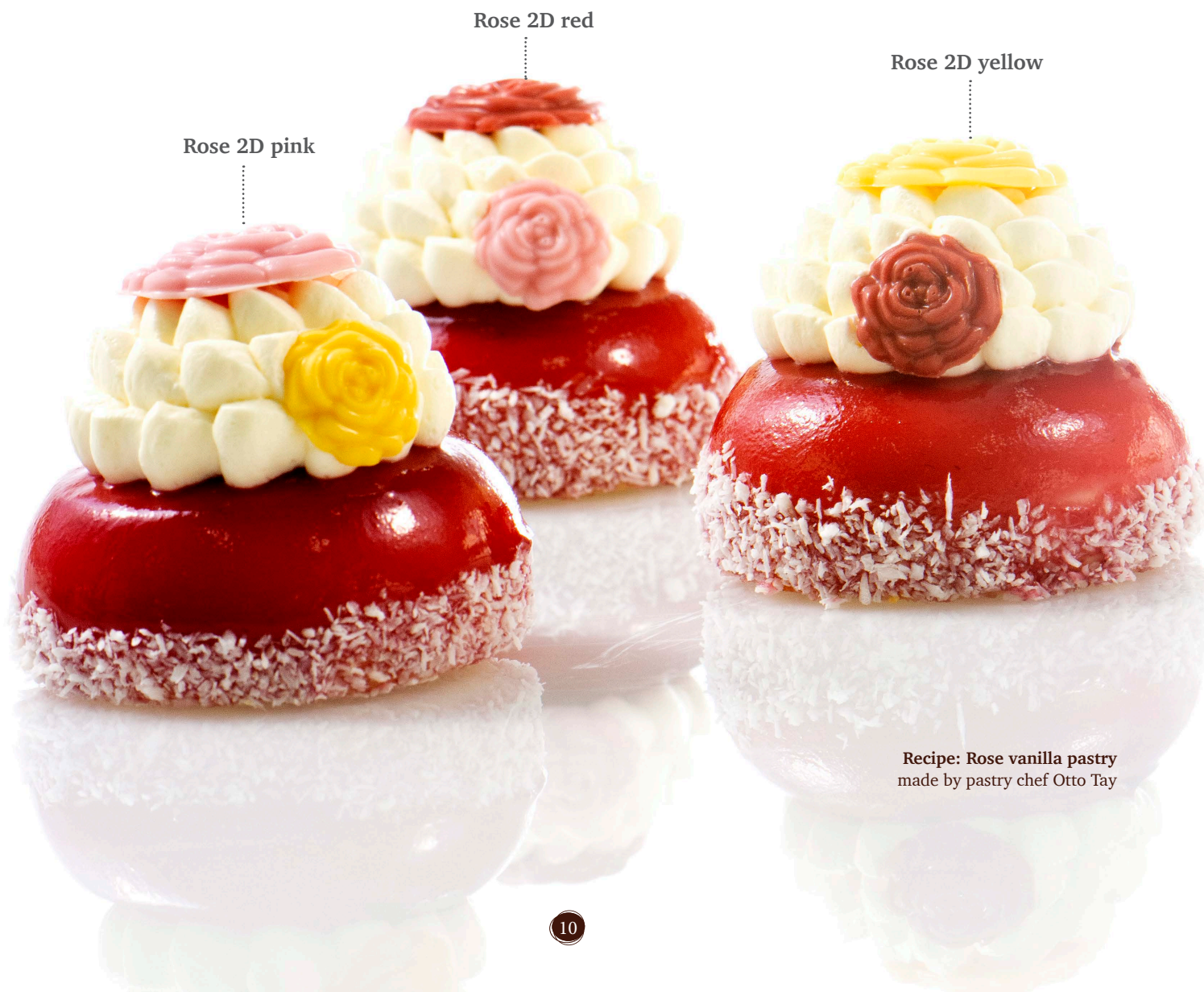
Rose 2D pink