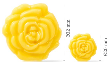
Rose 2D yellow