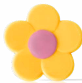
Buttercup 78227 ( \pm 302 pcs)