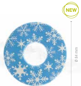
DT: Snowflake 77521 (144 pcs)