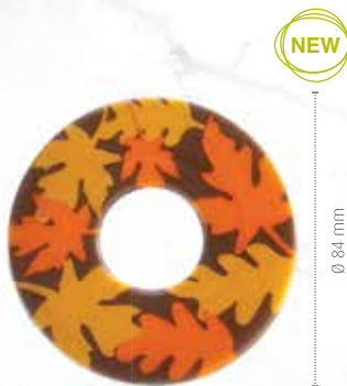
DT: Fall leaves 77522 (144 pcs)

THE LIMITED EDITION SEASONAL COLLECTION 2019/2020: