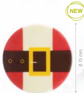
CT: Santa belt 77523 (216 pcs)