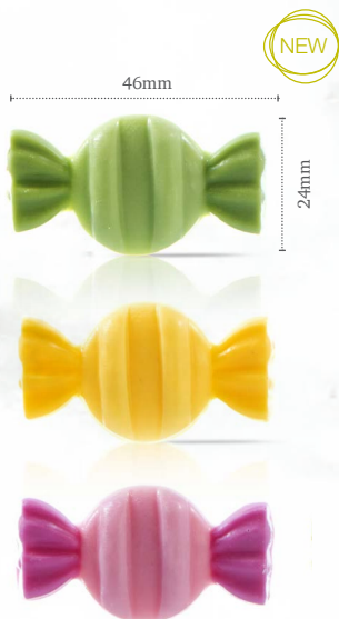
Candy assortment 78250 (90 pcs)