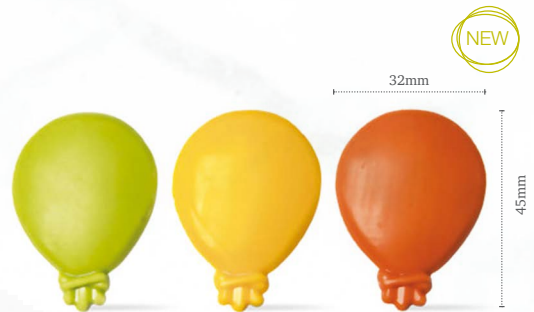
Balloons 71217 (160 pcs)