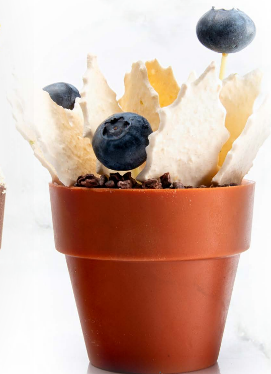
Flower pot large 18140 (28 pcs)