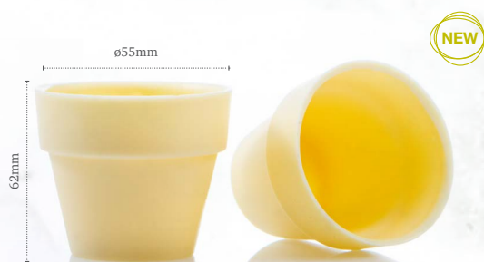
Flower pot white 18141 (28 pcs)