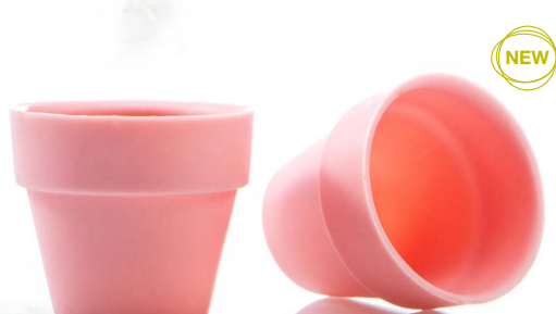
Flower pot pink 18145 (28 pcs)