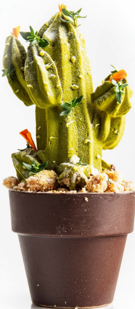
Flower pot dark 18143 (28 pcs)