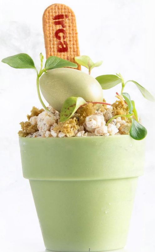
Flower pot green 18144 (28 pcs)