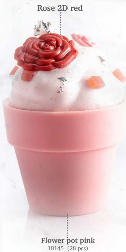
Rose 2D red