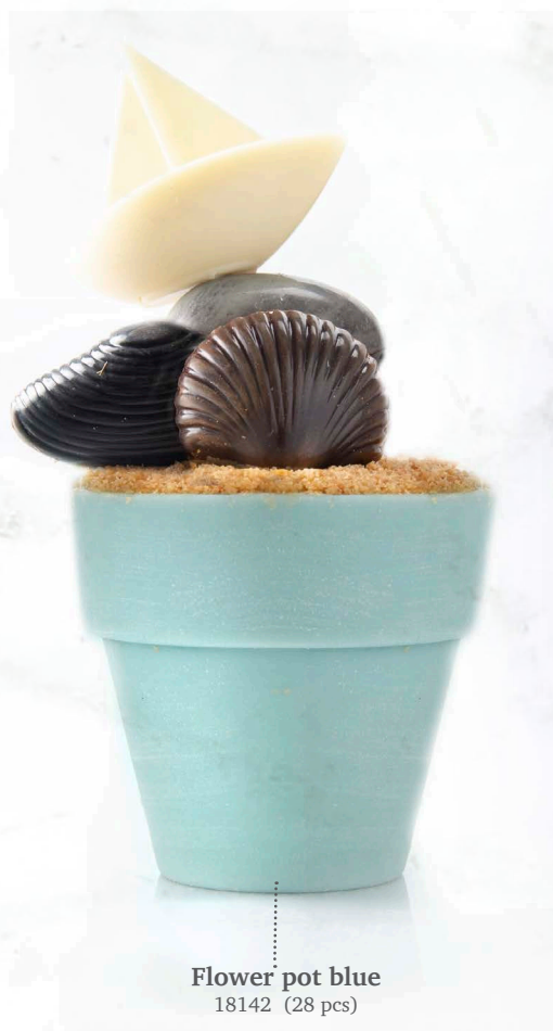
Flower pot blue 18142 (28 pcs)