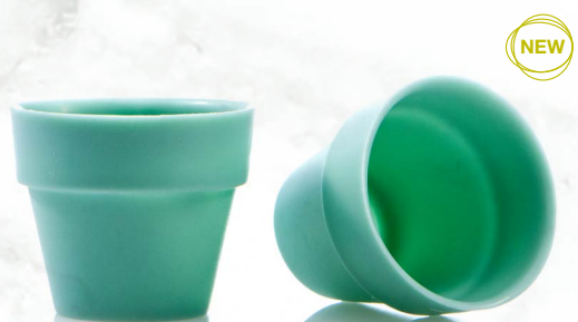
Flower pot blue 18142 (28 pcs)