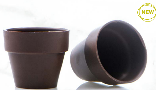
Flower pot dark 18143 (28 pcs)