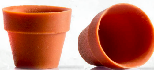
Flower pot large 18140 (28 pcs)