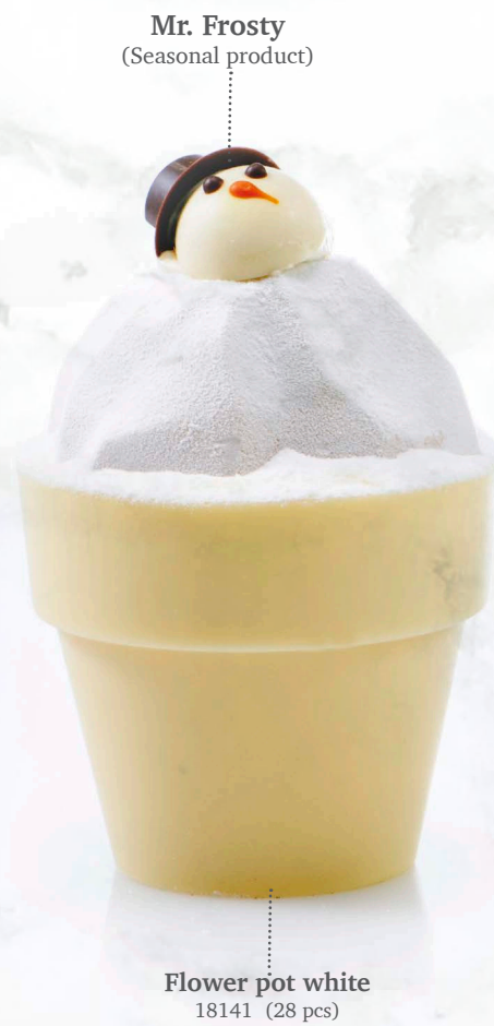
Mr. Frosty (Seasonal product)