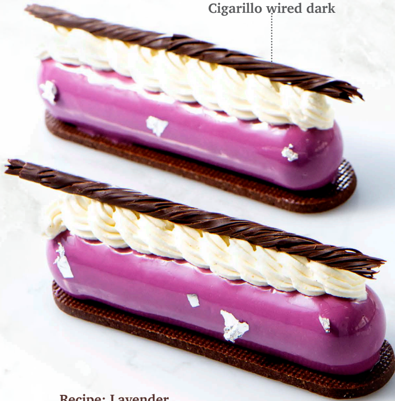
Cigarillo wired dark