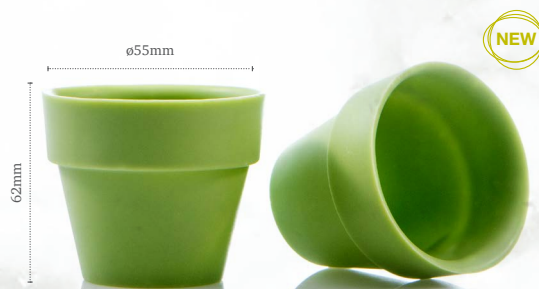
Flower pot green 18144 (28 pcs)