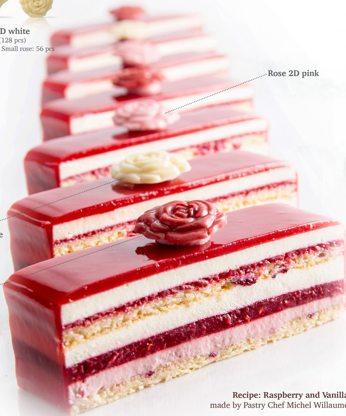
Rose 2D pink