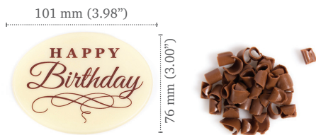
Birthday script kit 22060 · 20 cakes

An affordable way to limit waste, lower inventory and reduce SKUs by having all products in one convenient box. Kits include printed chocolate pieces and curls.