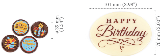
Birthday assortment dark 21436 (168 pcs)

Top your birthday desserts with our printed chocolate to create a unique customer experience.