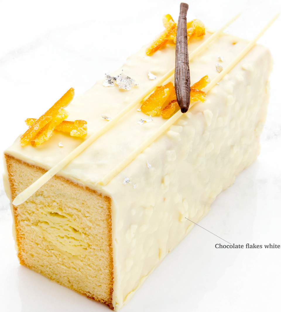
Chocolate flakes white

Recipe: Richly filled and decorated small cakes, sprinkled with Dobla Chocolate flakes dark for extra appeal.