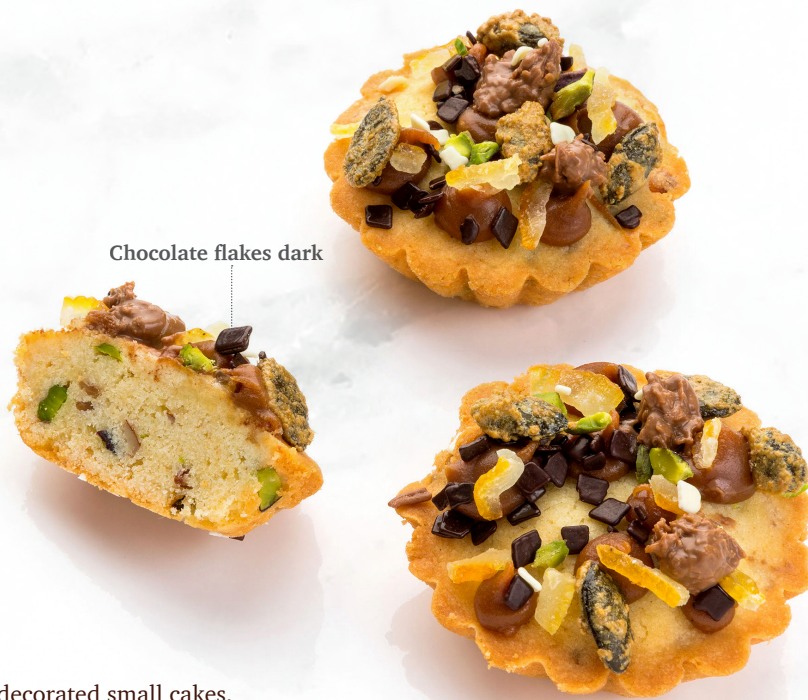
Chocolate flakes dark

Recipe: Richly filled and decorated small cakes, sprinkled with Dobla Chocolate flakes dark for extra appeal.