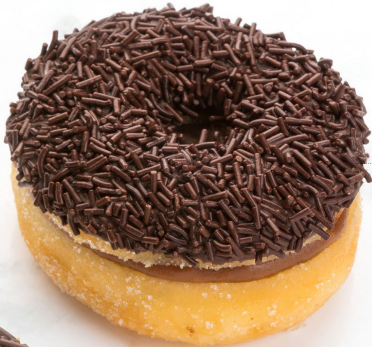
Chocolate vermicelli dark

Recipe: A classic donut, filled with an indulging cream, coated with chocolate and dipped in Dobla Chocolate Vermicelli dark for extra appeal and texture.