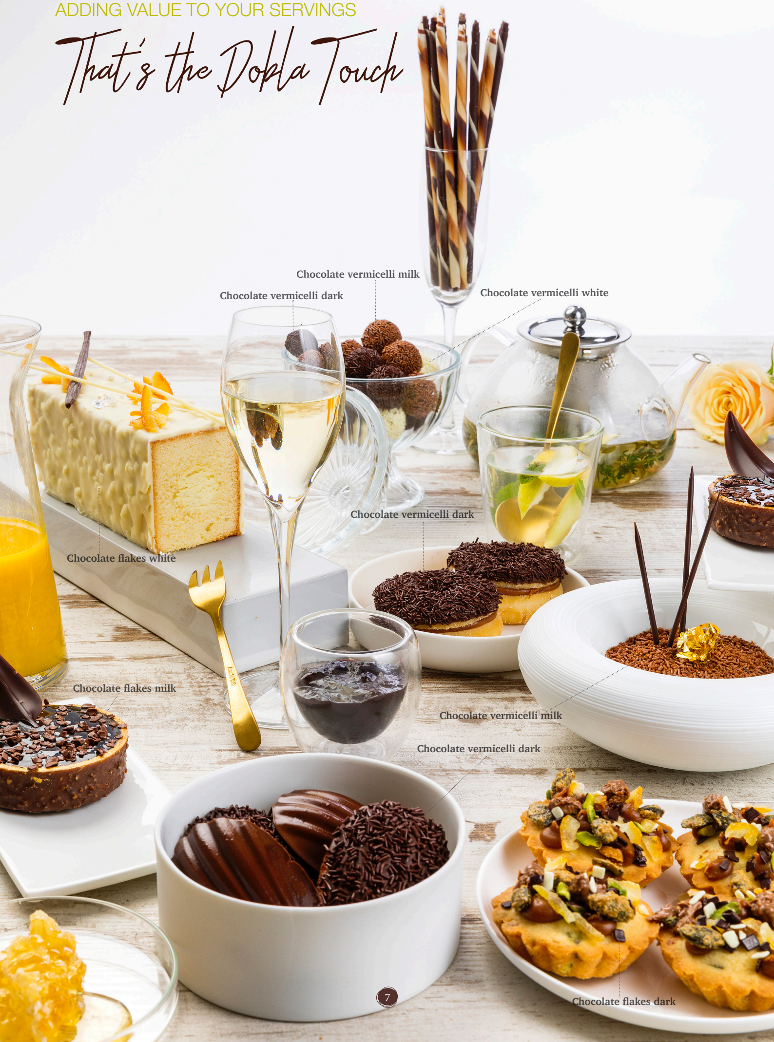
Chocolate vermicelli milk