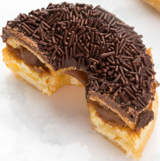
Chocolate vermicelli dark

Recipe: A classic donut, filled with an indulging cream, coated with chocolate and dipped in Dobla Chocolate Vermicelli dark for extra appeal and texture.