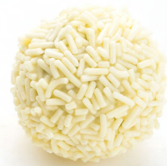
Chocolate vermicelli white